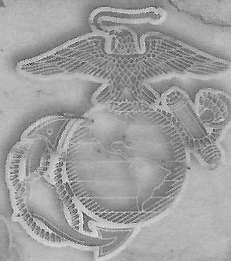
MAJOR GENERAL MERRITT A. EDSON