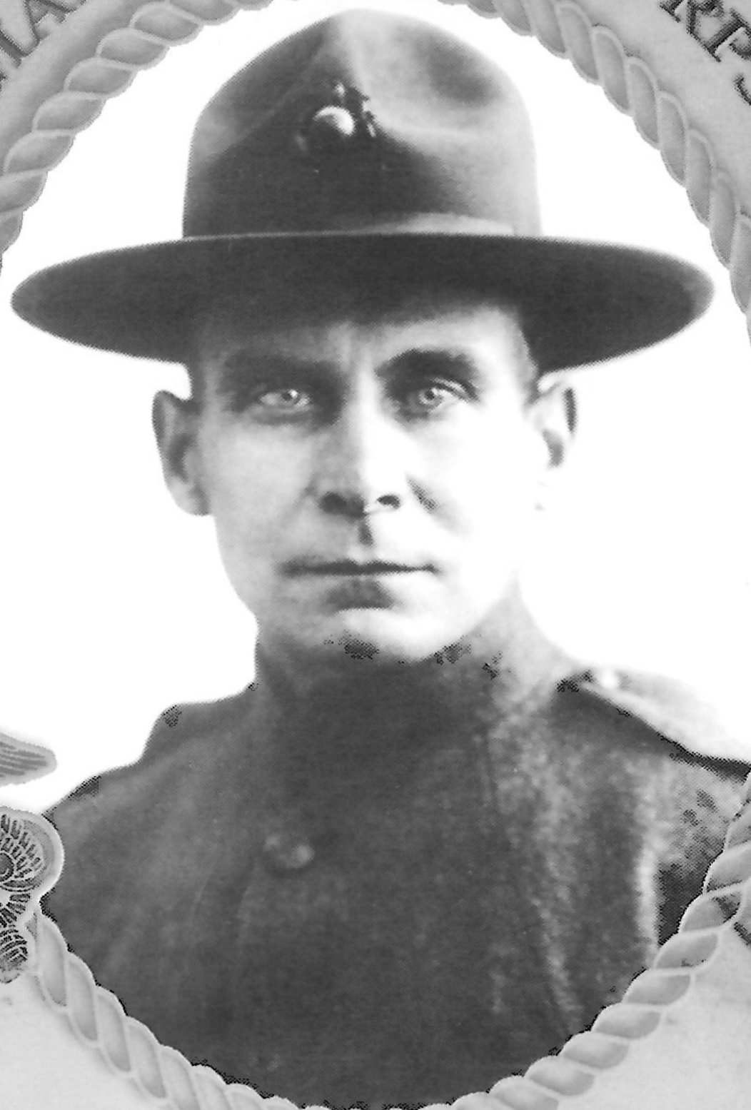
SERGEANT MAJOR JOHN H. QUICK