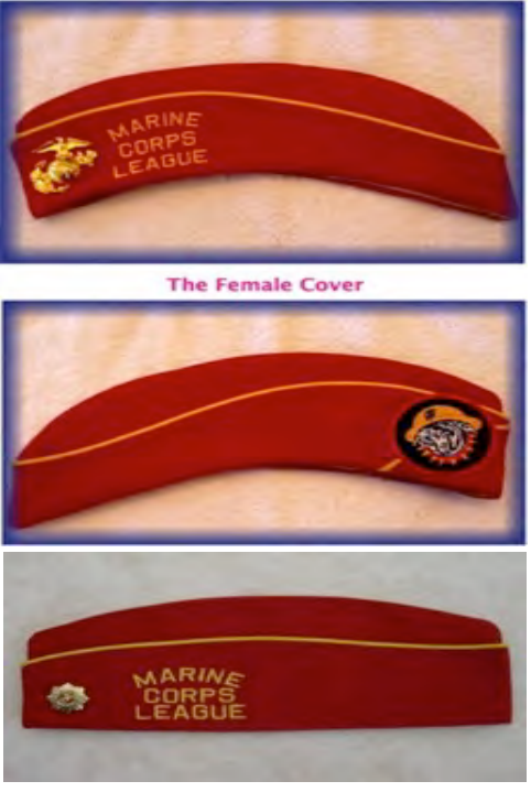
The Associate Cover