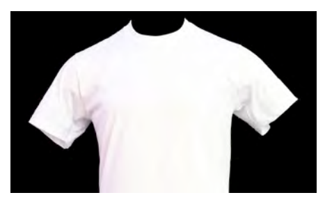
WHITE T-SHIRT Worn under MCL uniform shirts