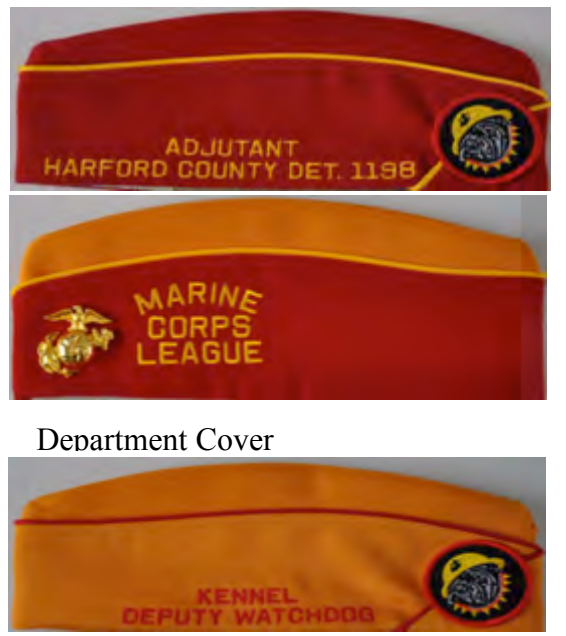
The National Cover