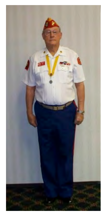
Blue Trousers with Red NCO Stripe